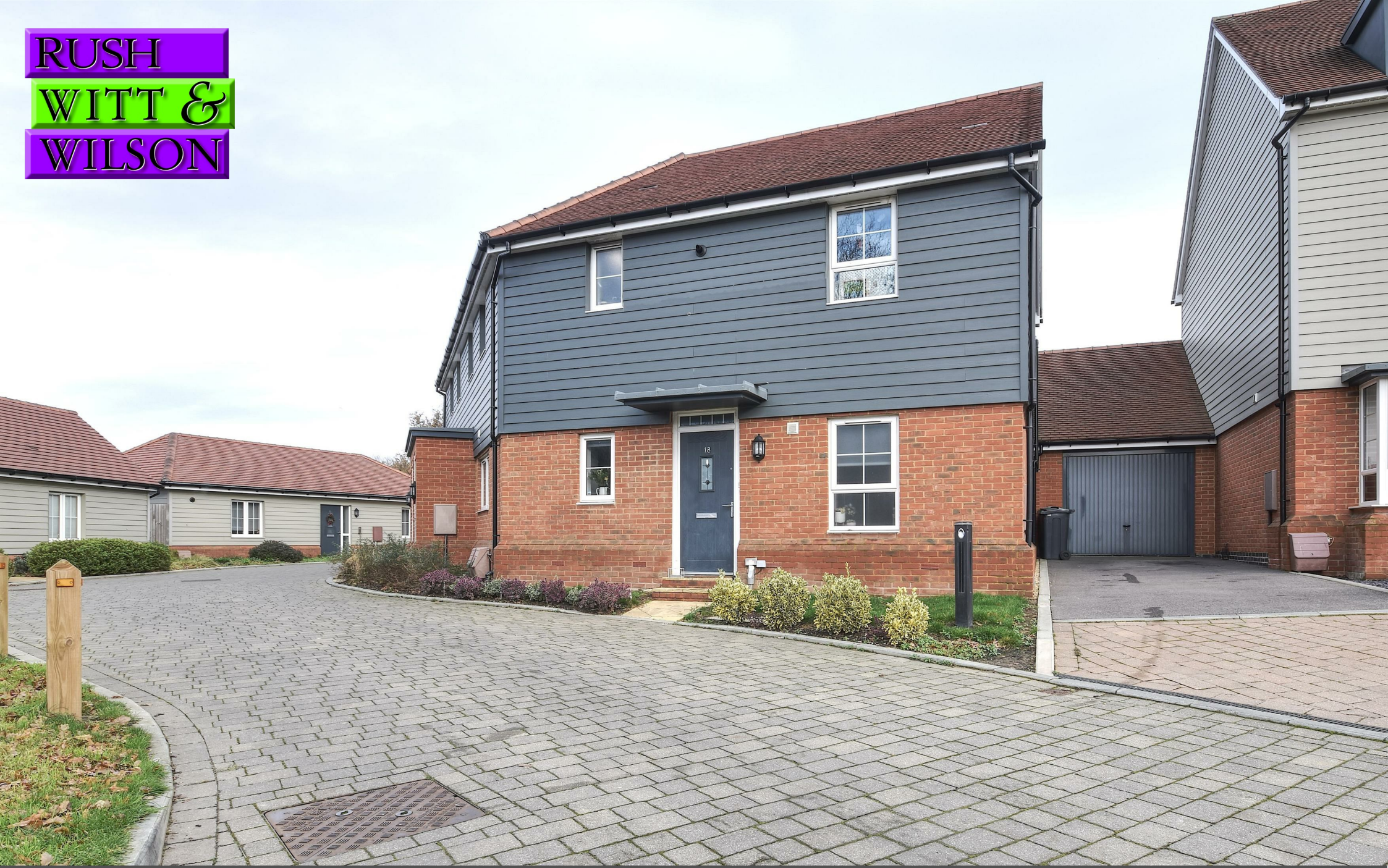
18 Brinklehurst Drive, Bexhill-On-Sea, East Sussex TN40 2FL Offers In The Region Of £192,500